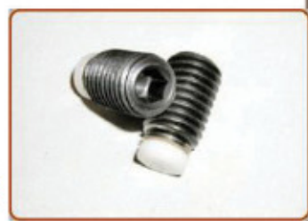
Farley Tension Screws