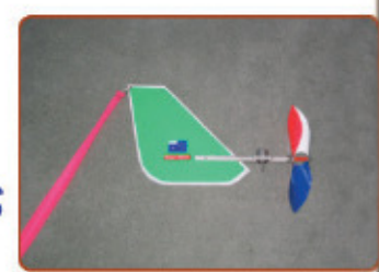
Aussie Wind Flags