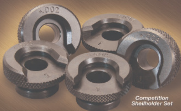
Competition Shellholder Set