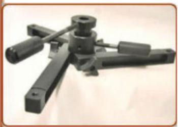
Lightweight Rest Bases