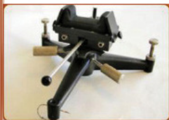
Joystick Rest Tops