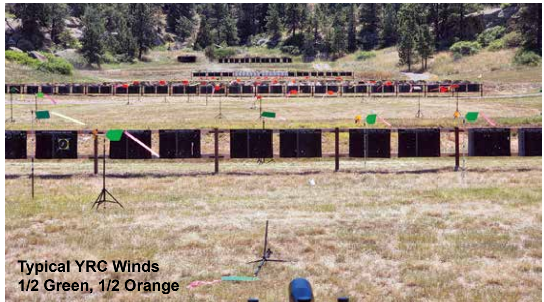
Typical YRC Winds 1/2 Green, 1/2 Orange