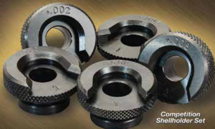
Competition Shellholder Set