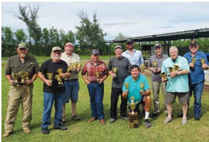
WINNERS 2022 Louisiana State Hunter Championship

SET NEW RECORDS WITH WORLD CLASS PRECISION