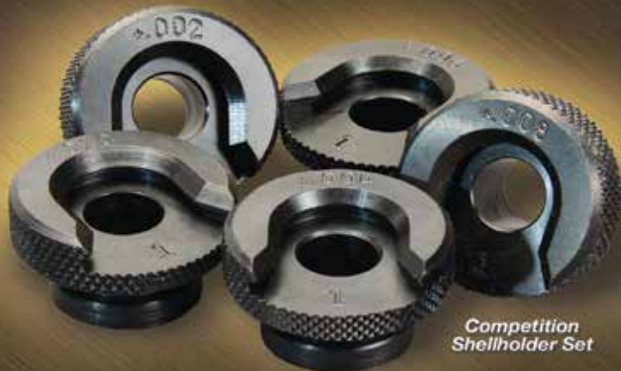
Competition Shellholder Set