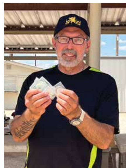
Speedy Gonzalez 2-Gun Winner